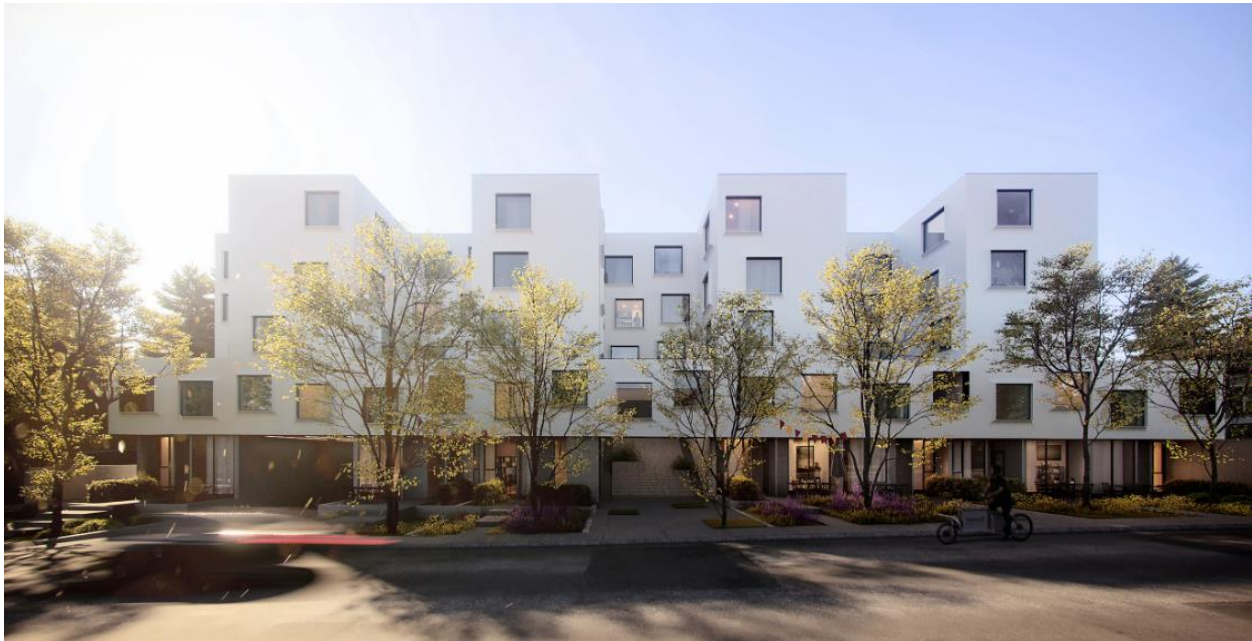
Figure 1: Rendering of Proposed Development (View looking east on 28 avenue SW)

Administration's review of the development will determine the ultimate building design, number of units and site layout such as parking, landscaping and site access. No decision will be made on the development permit application until Council has made a decision on this land use designation.