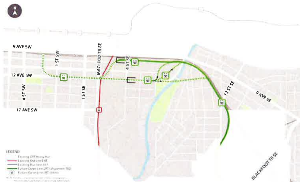
Figure 1: Beltline to Inglewood/Ramsay Alignment Study Area Showing Four Alignment Options

The attached table provides a summary of the options evaluation.