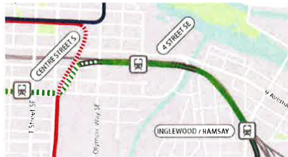
Figure 8: Option 4

To connect from 12 Avenue S to the previously approved Green Line alignment next to the CPR corridor, the LRT tunnel would continue under MacLeod Trail SE along 12 Avenue SE, and at a point east of Macleod Trail SE, turn north proceeding in a north-easterly direction coming to surface on the north side of 10 Avenue SE adjacent to the CPR right of way. It would then proceed eastward over 4 Street SE underpass with a station adjacent to the underpass.