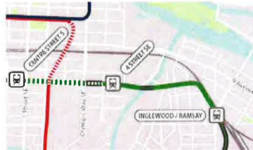
Figure 5: Option 2

The option to continue the LRT over the Elbow River and connect at surface along MacDonald Avenue SE had the most direct connection from 12 Avenue S to the Inglewood/Ramsay station. This option was shared with the Ramsay Community Association in September 2016, and the community identified numerous challenges. At that time Administration was still investigating constraints and opportunities in Victoria Park to better understand alignment options. In early 2017, this option was brought forward again,