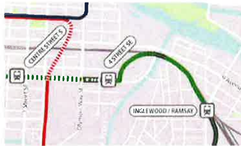
Figure 2: Option 1

In order to connect from 12 Avenue S to the previously approved Green Line alignment next to the CPR corridor, the LRT would turn north onto 6 Street SE and then turn east onto the north side of the Victoria Park Transit Centre (VPTC). Assuming 4 Street SE station to be located between 5 Street SE and 6 Street SE and space proofing for the 6 Street SE underpass, this shifts the LRT onto the east side of 6 Street SE which conflicts with the bus fueling and fare collection stations at the VPTC. This alignment also results in several tight curves which impacts LRT run times, operations and maintenance.