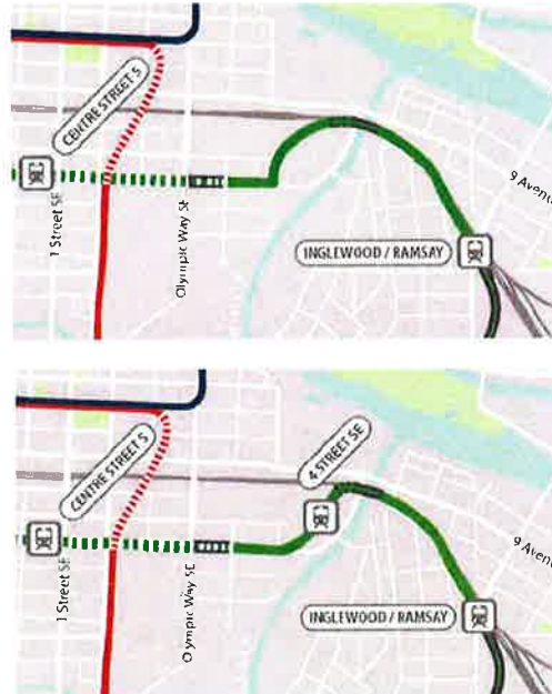
Figures 6 and 7: Option 3

The long-term condition allows for improved LRT geometry with wider track curves as compared to the interim condition. It also locates 4 Street SE station a block away from the Stampede grounds and close to the future Elbow River pathway. Given the potential redevelopment of the VPTC site, this option was preferred to provide an opportunity to integrate the LRT and station with future redevelopment if the VPTC is potentially being relocated in the near term, however, there would still be issues with the portal between 4 Street SE and 5 Street SE. The opportunities and challenges are summarized below: