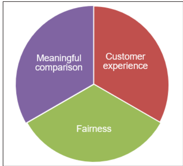
FIGURE 1. PRINCIPLES FOR THE PILOT PROJECT

Selecting a pilot area that is representative of Waste & Recycling Services’ (WRS’) residential collection services will support a meaningful comparison. The Request for Proposal (RFP) will identify performance measures and service requirements allowing meaningful and objective comparison between service delivery models.