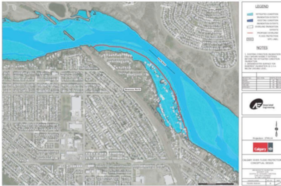
FIGURE 1 - BOWNESS NORTH

The AE report shows through flood modelling (using its conservative inputs) that groundwater flooding for a 1:20 year event with a berm in place will do very little to protect homes in the area from groundwater flooding. Figure 1 and 2 show that even with the berm in place (the red line), extensive groundwater flooding will occur in Bowness. The dark blue areas of the map in figure 2 show that very few homes would not experience groundwater flooding.