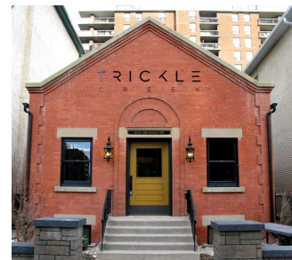
West End Telephone Exchange (built 1910) Municipal Historic Resource designated February 2018 utilized density transfer program