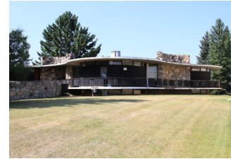
Blum Residence (built 1963) Municipal Historic Resource designated November 2018

Density Transfer is a significant planning incentive available to owners of Municipal Historic Resources in the Downtown, Beltline, and East Village areas. A historic resource can transfer unused development rights (density) to a new development site at a privately negotiated profit—supporting growth, and benefiting heritage conservation. Further information on density transfer can be found in Attachment 9 to this report, and at calgary.ca/heritage .