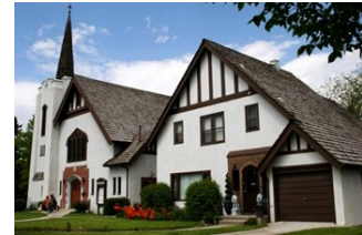
Scarboro United Church (built 1929)

Alberta Culture and Tourism operates a Provincial-level grant program, providing matching funds to owners of historic sites under terms and conditions established by the Alberta Historical Resources Foundation (available online through www.culturetourism.alberta.ca ). The designation of a property as a Municipal Historic Resource qualifies a property owner to apply for up to $50,000 per year in Provincial matching funds, as opposed to a one-time grant of $5,000 available to non-designated sites.