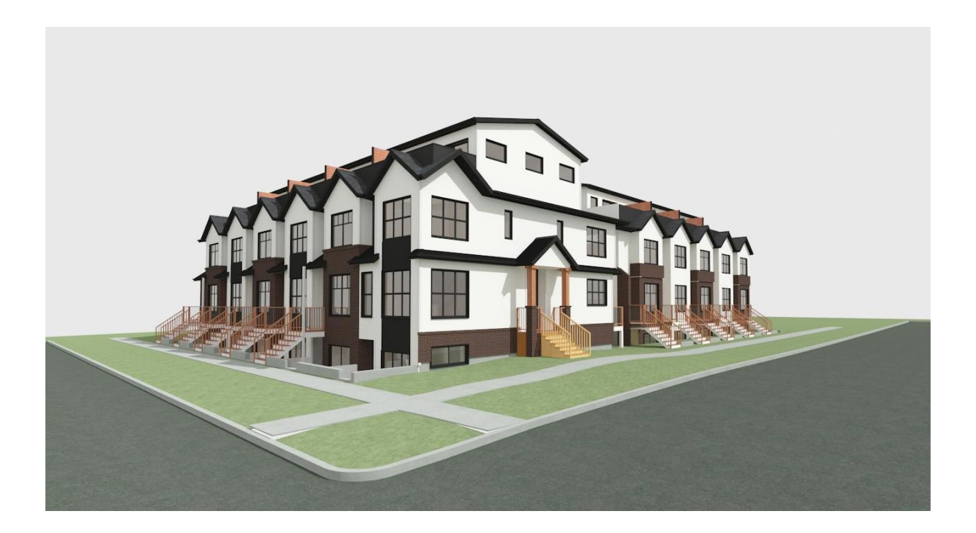
Figure 1: Rendering of Proposed Development (View from the Intersection of 14 Street SE and 10 Avenue SE)

Administration's review of the development permit will determine the ultimate building design and site layout details such as parking, landscaping and site access. No decision will be made on the development permit application until Council has made a decision on this land use redesignation.