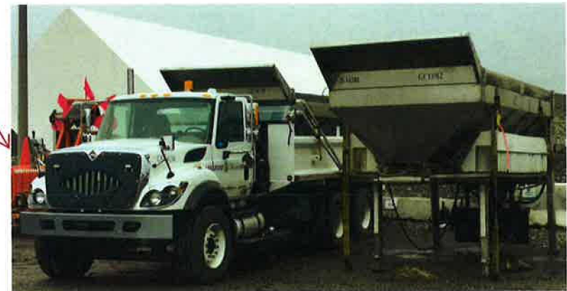
Sander (Snow and ice control and gravel application)