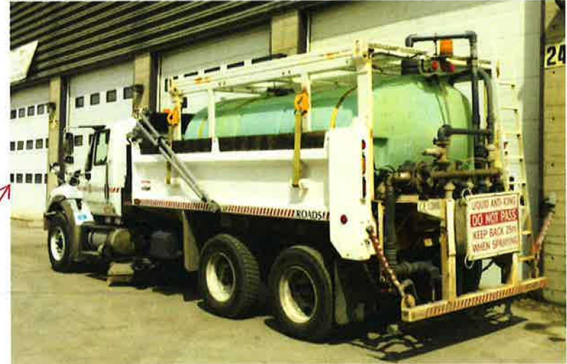
Drip tank (Winter and spring clean-up)