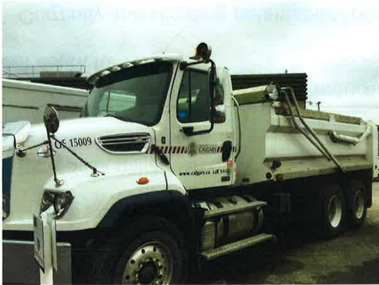
Dump truck (Year-round)