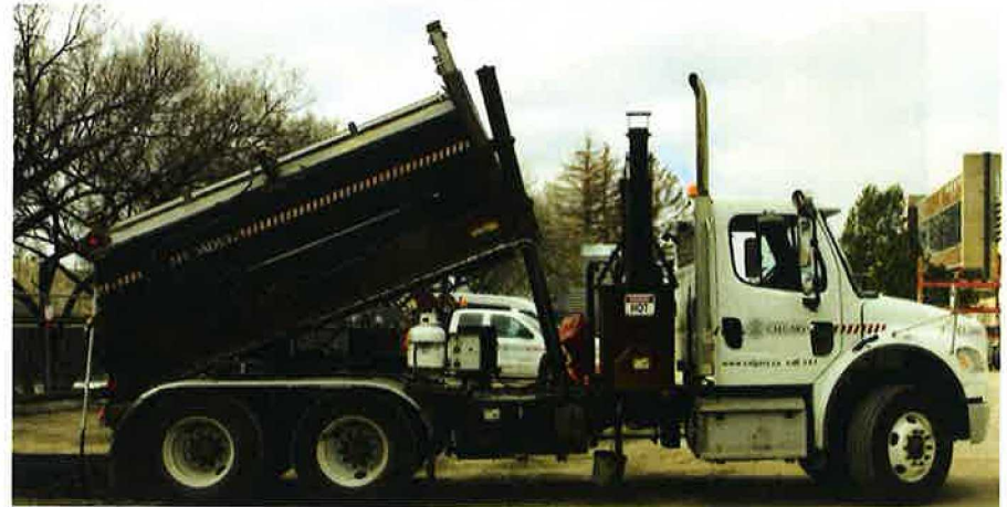
Current unit: Fix mounted chassis asphalt carrier