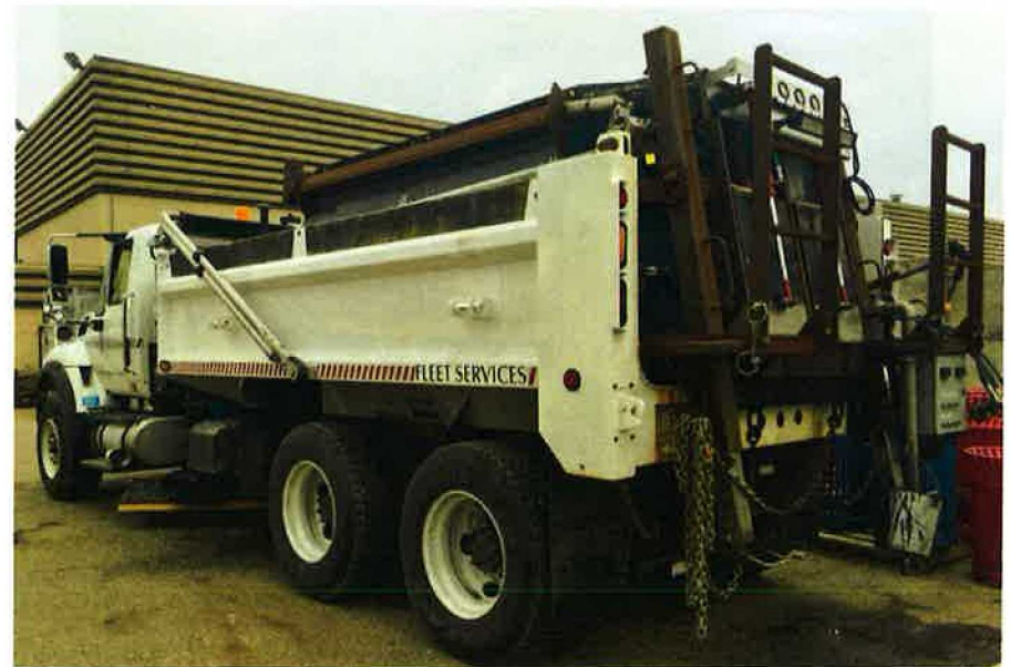
Slip-in asphalt carrier / recycler mounted to truck