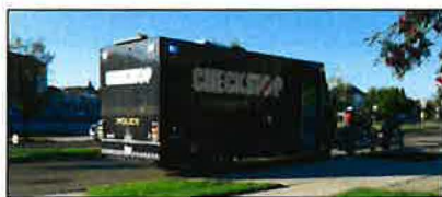
School blitz utilizing Checkstop bus at a Copperfield elementary school during "Back to School" month in September 2019