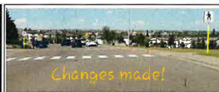
Playground zone extension/crosswalk sleeves installed at Harvest Hills Dr & Harvest Oak Vw NE