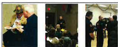
Ward 1 Traffic Safety Meeting