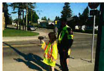
Community Speed Watch – Alexander Ferguson School