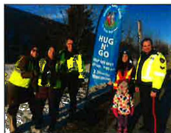
New Hug and Go Flags installed at Hidden Valley School

Spent lengthy time in the zone. Four people stopped to talk to me and one fellow suggested that we should be here on weekends as he thinks people forget the zone is in effect on the weekends. Had no less than 15 drivers give me the thumbs up for being there. Two different people brought me coffee.