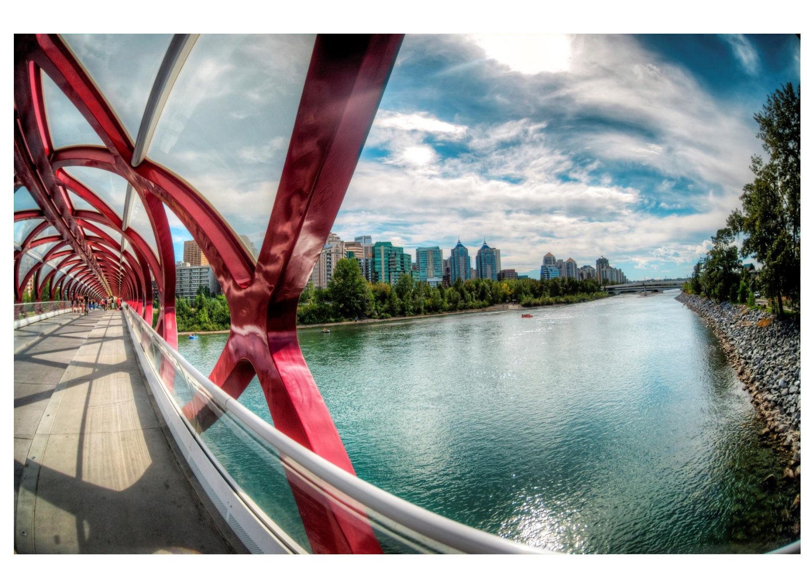
Civic Census Review