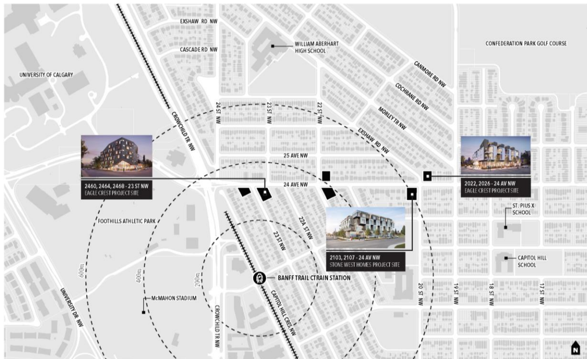
FIGURE 1.1 24 AV NW CORRIDOR REDEVELOPMENT

During the course of the application review process, the Banff Trail Community Association Planning & Development Committee membership underwent wholesale change. While the current voice of the Community Association remains unclear, meetings and early correspondence with the former committee indicated a favourable review of the development proposals. While no official letter from the Community Association has been received, a personalized letter of support from the former chair of the Planning & Development Committee and other former members have been provided.