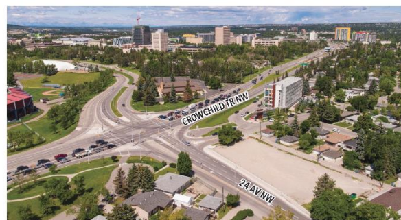
The Banff Trail Area Improvements Project, which includes improvements to the 24 AV NW corridor and Crowchild TR NW intersection, has been fully funded as part of The City's four-year capital plan.