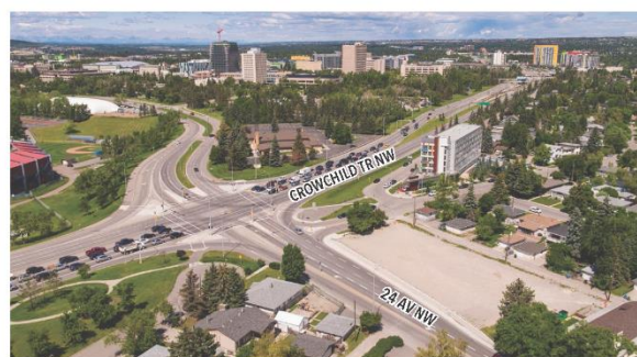
The Banff Trail Area Improvements Project, which includes improvements to the 24 AV NW corridor and Crowchild TR NW intersection, has been fully funded as part of The City's four-year capital plan.