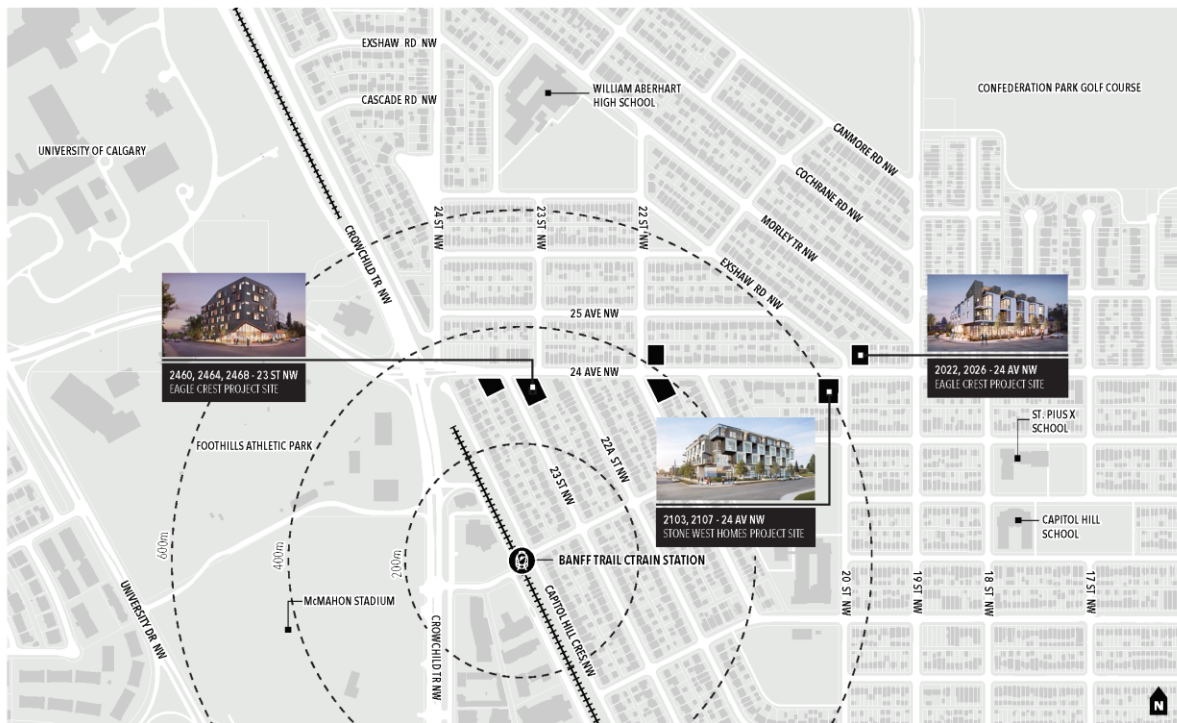
FIGURE 1.1 24 AV NW CORRIDOR REDEVELOPMENT

During the course of the application review process, the Banff Trail Community Association Planning & Development Committee membership underwent wholesale change. While the current voice of the Community Association remains unclear, meetings and early correspondence with the former committee indicated a favourable review of the development proposals. While no official letter from the Community Association has been received, a personalized letter of support from the former chair of the Planning & Development Committee and other former members have been provided.