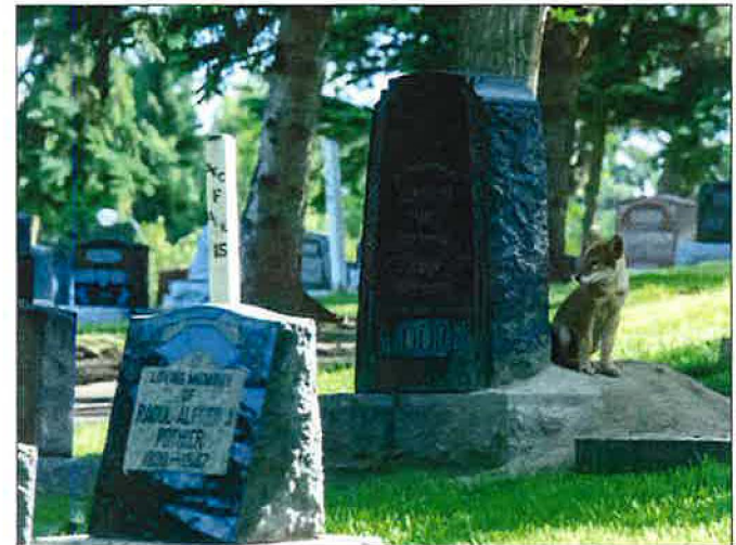
Sometimes a pest; sometimes controls pests