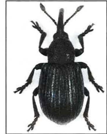
Target weed: Scentless Chamomile Gall midge Stem weevil