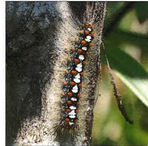
Satin Moth caterpillar