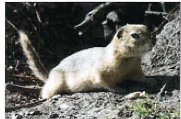
Richardson's ground squirrel