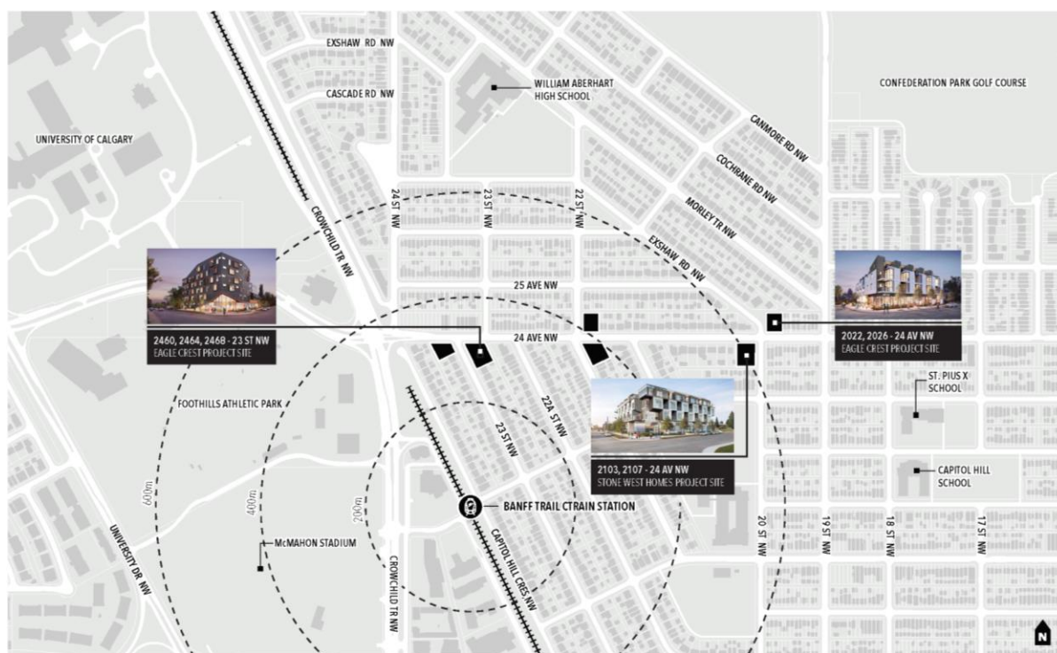
FIGURE 1.1 24 AV NW CORRIDOR REDEVELOPMENT

During the course of the application review process, the Banff Trail Community Association Planning & Development Committee membership underwent wholesale change. While the current voice of the Community Association remains unclear, meetings and early correspondence with the former committee indicated a favourable review of the development proposals. While no official letter from the Community Association has been received, a personalized letter of support from the former chair of the Planning & Development Committee and other former members have been provided.