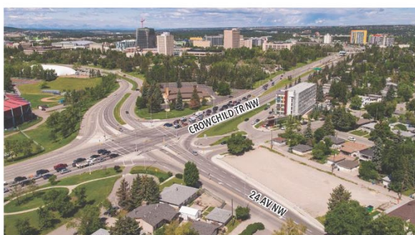
The Banff Trail Area Improvements Project, which includes improvements to the 24 AV NW corridor and Crowchild TR NW intersection, has been fully funded as part of The City's four-year capital plan.