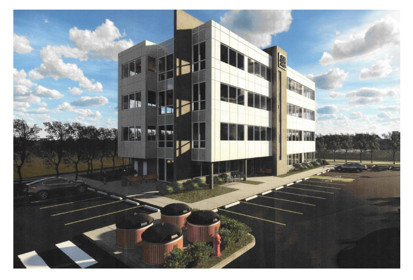
Figure 1: Rendering of Proposed Development (View from southwest corner of site)

Administration's review of the development permit will determine the ultimate building design and site layout details such as parking, landscaping and site access. No decision will be made on the development permit application until council has made a decision on this land use redesignation.