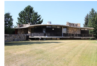
Blum Residence (built 1963) Municipal Historic Resource Designated November 2018

Density Transfer is a significant planning incentive available to owners of Municipal Historic Resources in the Downtown, Beltline, and East Village areas. A historic resource can transfer unused development rights (density) to a new development site at a privately negotiated profit—supporting growth, and benefiting heritage conservation. Further information on density transfer can be found at calgary.ca/heritage .