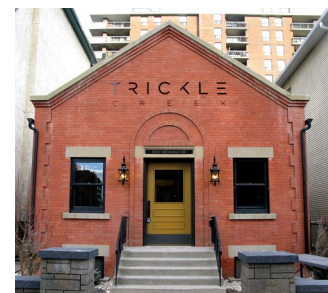
West End Telephone Exchange (built 1910) Municipal Historic Resource