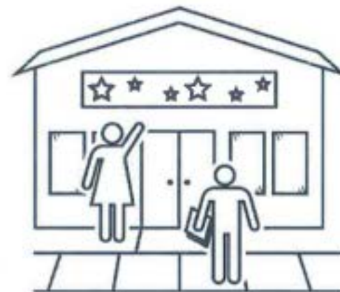
Business support management