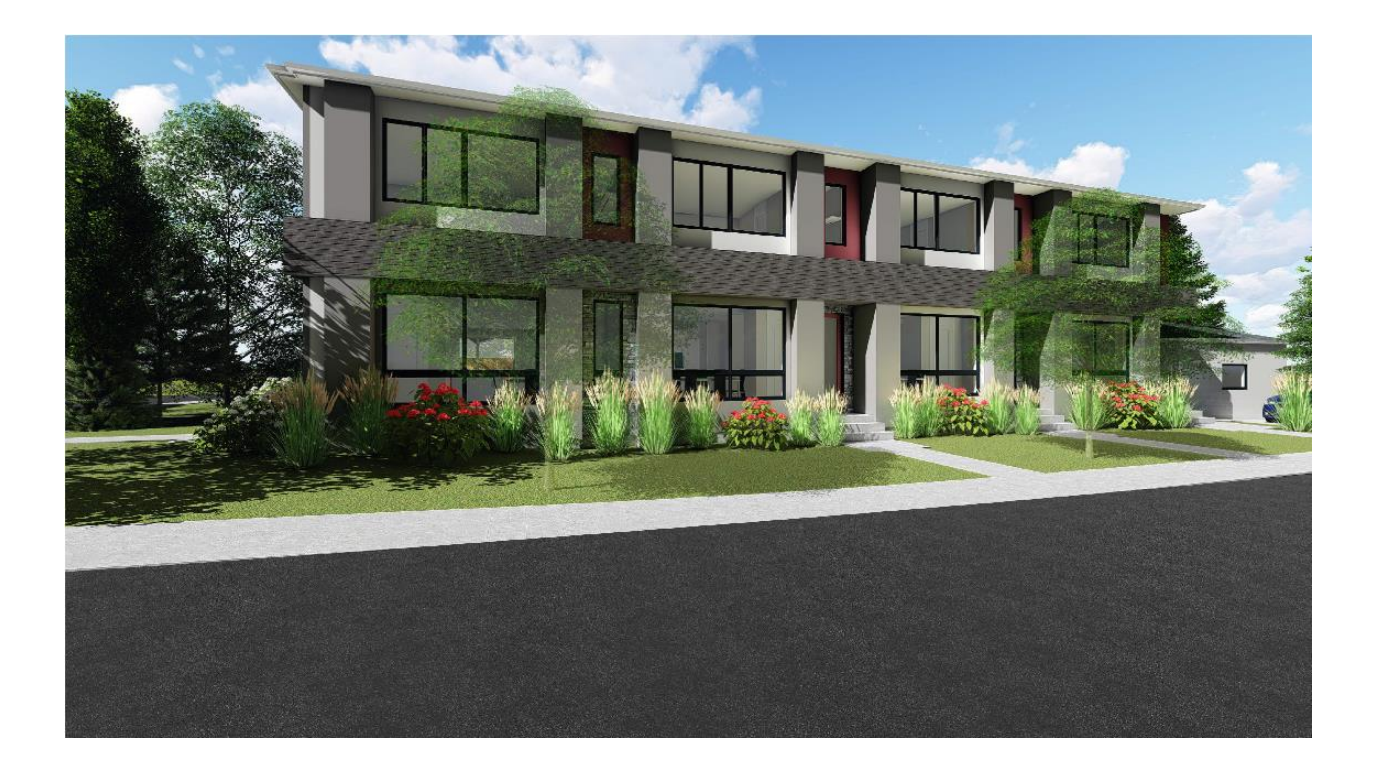
Figure 1: Rendering of Proposed Development (View from 46 Avenue NW)

Administration's review of the development permit will determine the ultimate building design, number of units and site layout details such as parking, landscaping and site access. No decision will be made on the development permit application until council has made a decision on this land use redesignation.