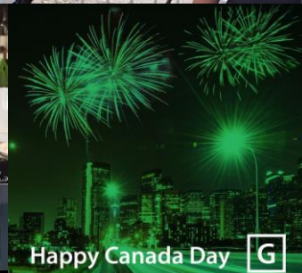
Happy Canada Day