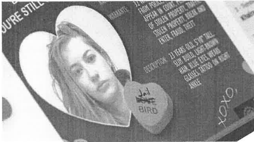
Calgary police removed a social media campaign which featured suspects wanted on warrants in punny Valentine's Day cards. "We're not fooled by the rocks that you got, you're still Jenny from the (cell) block," this card reads, referencing a Jennifer Lopez song.